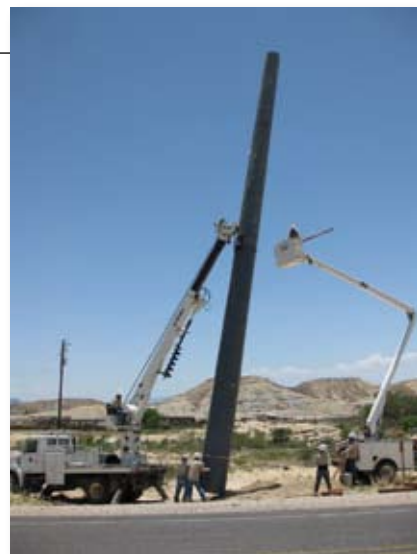
Rio Grande crews installing a large diameter three-module RStandard pole that obviates the need for guy wires. Note the relatively small equipment needed for the direct bury installation.

“If we could afford to replace all our poles tomorrow with the RStandard pole, we would do it given the increased